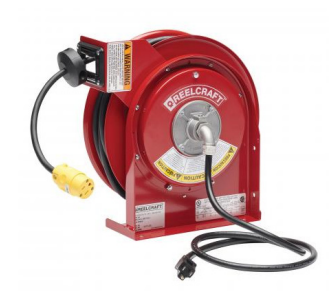
Series L: power cord reels